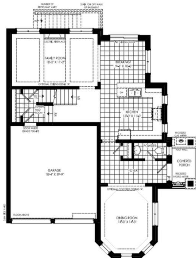
MAIN FLOOR PLAN ELEVATION T