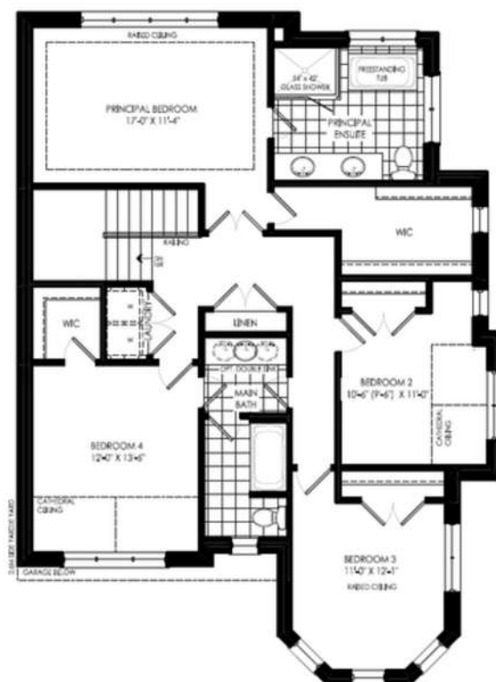
OPT UPPER FLOOR PLAN ELEVATION T